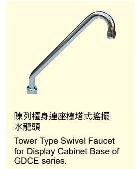
陳列櫃身連座檯塔式搖擺水龍頭 Tower Type Swivel Faucet for Display Cabinet Base of GDCE series.