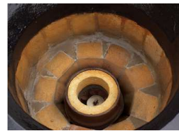
Ø75mm 強力溝風爐頭 Ø75mm Air blast burner assembly