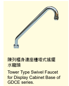
陳列櫃身連座檯塔式搖擺水龍頭 Tower Type Swivel Faucet for Display Cabinet Base of GDCE series.