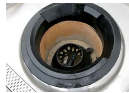
16 咀噴射爐頭 16 Jet Burner assembly