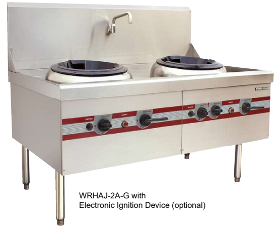
WRHAJ-2A-G with Electronic Ignition Device (optional)