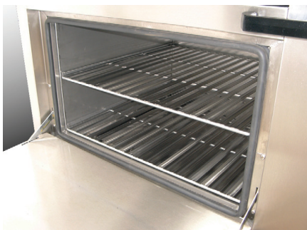
Stainless steel slatted bar shelving